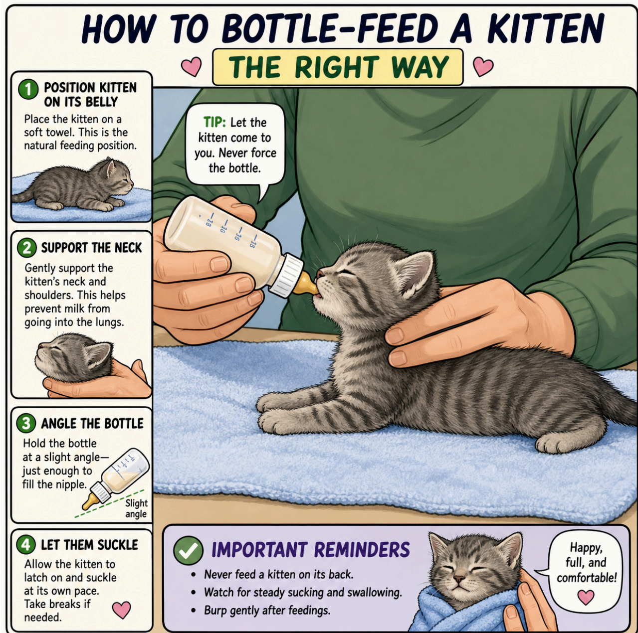
Caption: Always feed your kitten on its belly, never on its back. Support its neck and let it suckle gently. Watch for drips – that means it's full!