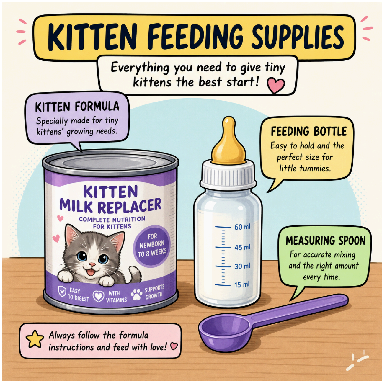
Caption: Gather special kitten formula, small bottles, and measuring tools. No regular milk for tiny tummies!