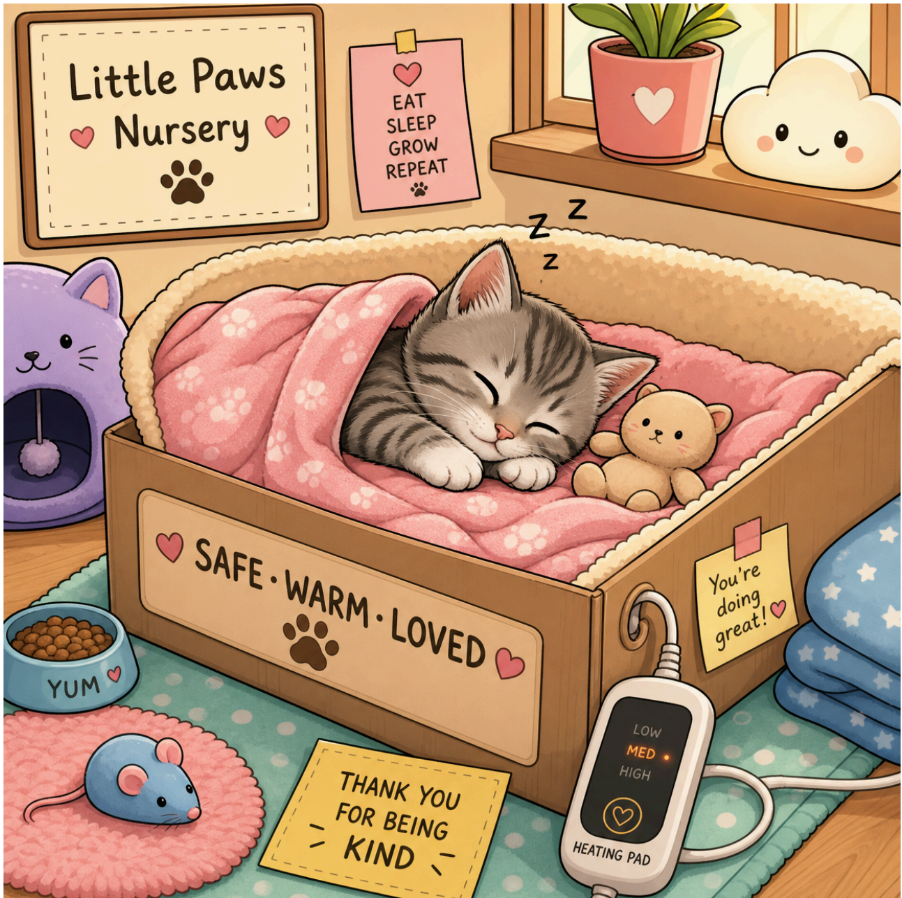
Caption: Make sure your kitten has a warm, safe, and quiet space all to themselves. Think cozy and comfy!